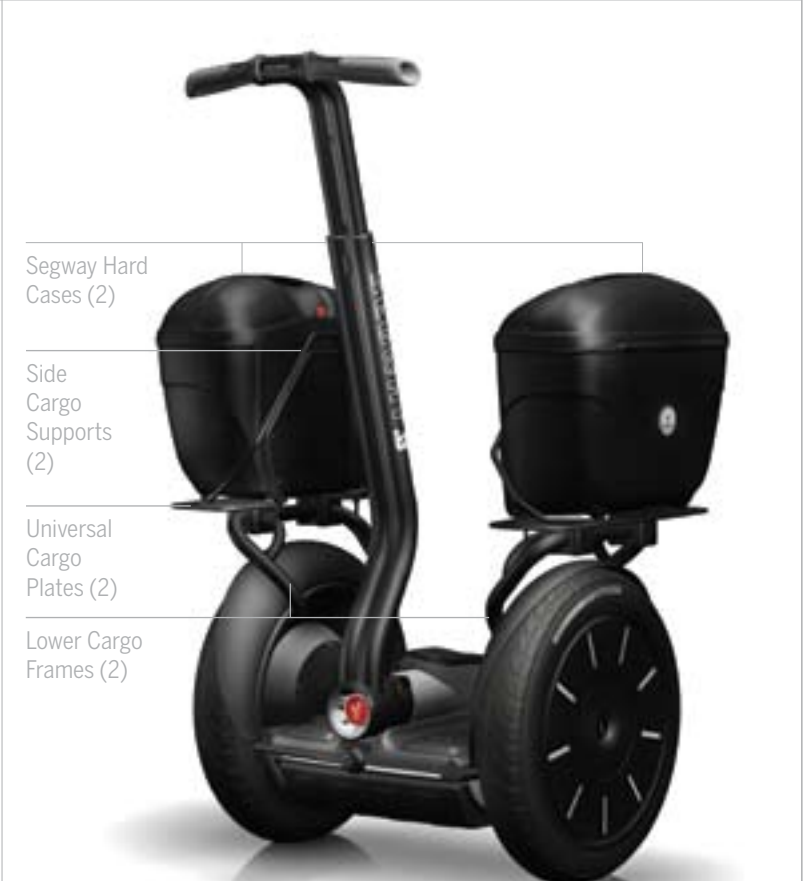
Segway Hard Cases (2)