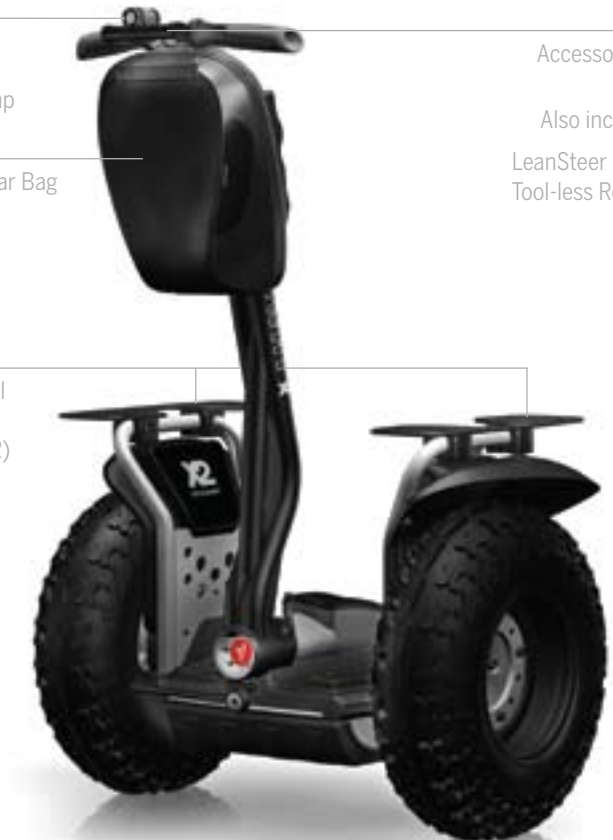
Also included: LeanSteer Frame Tool-less Release