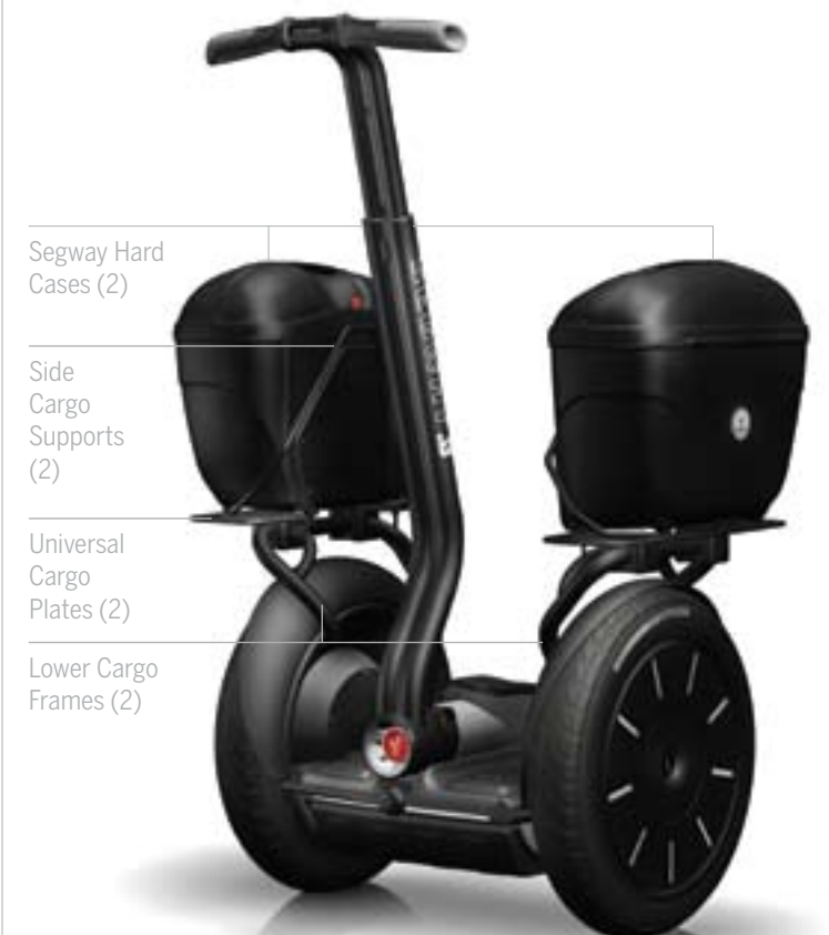
Segway Hard Cases (2)